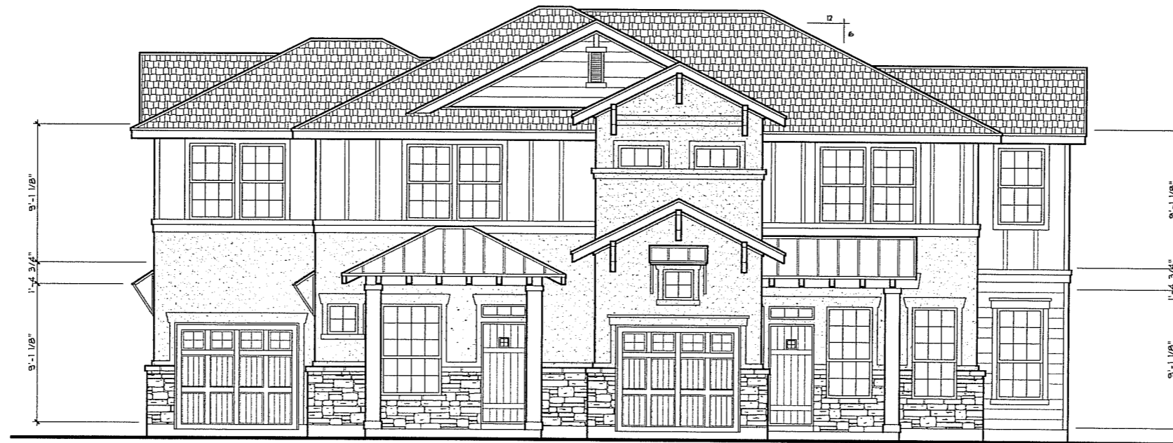
Front Elevation Sketch 1435 Sketch 1457

©2007 Kipp Flores Architects, Inc. All rights reserved. This drawing is the property of Kipp Flores Architects, Inc. and is not to be reproduced, stored in a retrieval system, or transmitted in any form or by any means, electronic, mechanical, photocopying, recording, or by any information storage and retrieval system, without the prior written permission of Kipp Flores Architects, Inc.