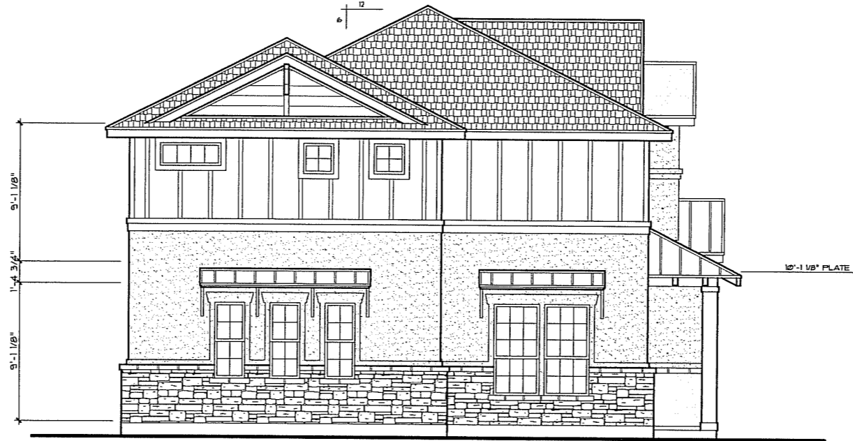
Right Elevation Sketch 1435